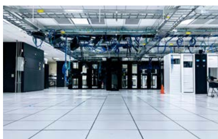
Data centres and telecoms