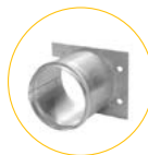
Air duct connection adaptor - 1306539

Rotomoulded technology is often used to make sturdy products such as kayaks and playground equipment.