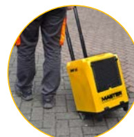
Extendable, easy to use handle