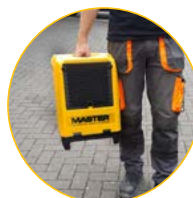
Compact and lightweight

The DHP 20 is a small and lightweight building dryer in sturdy rotomoulded casing designed for professional use in challenging working conditions. The easy to handle unit comes standard with an onboard, integrated water pump and offers fast and efficient drying in small spaces after water damage, during construction work and more.