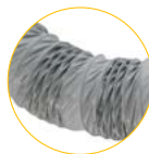
Air duct, 5m, Ø10cm - 1250108