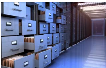
Storage, preservation and archives