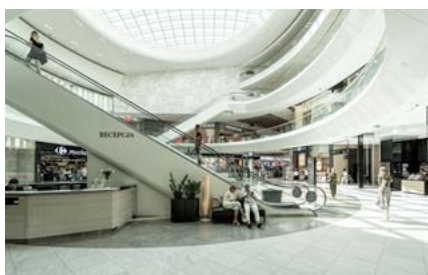
Buildings and commercial spaces