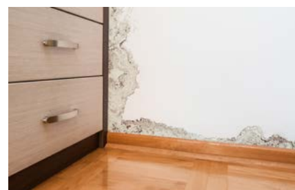
Water damage restoration