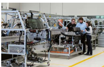
General industry and production